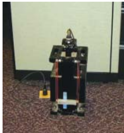
An active control system for reducing unwanted floor vibrations. The system installed in the New Jersey office building was approximately 20" tall and "camouflaged" in an enclosure to blend with the office furniture.

AISC members and ePubs subscribers can download a free copy of Design Guide 11: Floor Vibrations Due to Human Activity by visiting www.aisc.org/vibration .