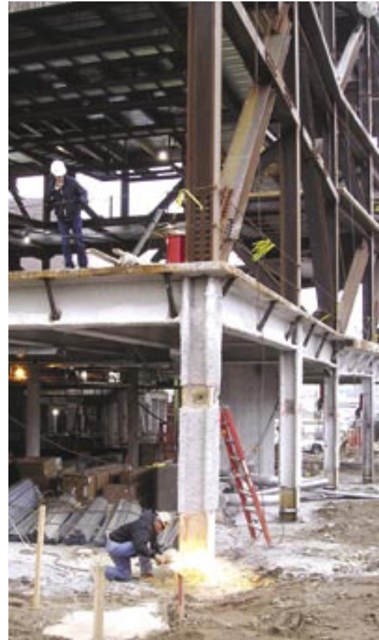
Twelve temporary perimeter columns were installed to make erection easier. They were sequentially removed after erection was complete.

The erector devised a method to remove the temporary shoring columns by simply cutting away a pre-determined portion of the column flange and web near its base to bring the column cross-section close to failure. After the initial cut, the remaining steel was heated until smooth failure and load release occurred. The method worked flawlessly—by noon on the day devoted to shoring removal, all 12 columns had been cut. As