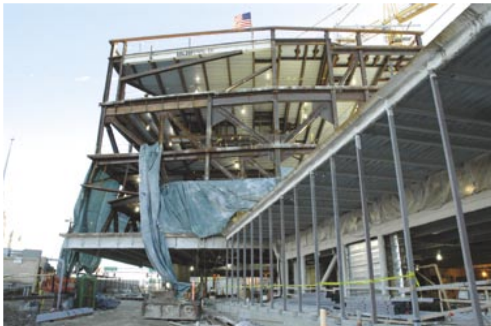
In this photo, the erection columns have been removed from the lower level, transferring the structural loads into the multi-story trusses.