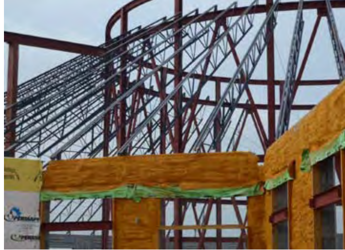
Above: Steeply sloped open web steel joists require a much greater seat depth, at the high end, than those placed more nearly horizontal.