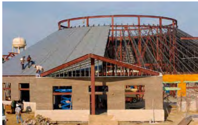
Above: Placement of steel decking to form the roof of the office complex followed quickly after the sloping joists were put in place.