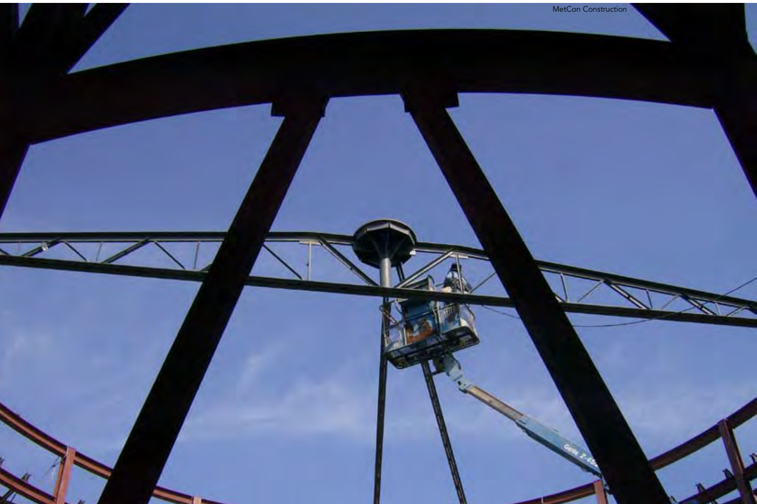
Above: A built-up platform at the center of a 63-ft girder truss provides the upper support for the steel joists supporting the roof.

Tribal leaders are excited that they will be able to better serve their members. They also know the building will serve as a landmark for future generations.