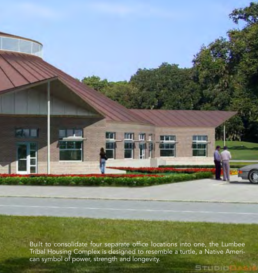
Built to consolidate four separate office locations into one, the Lumbee Tribal Housing Complex is designed to resemble a turtle, a Native American symbol of power, strength and longevity.